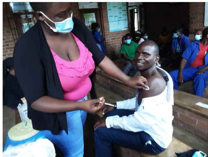
A woman in Malawi vaccinates a young man

In initial vaccine rollout where countries prioritize essential health workers, women should be more than half of people who receive vaccines. This is rarely the case.